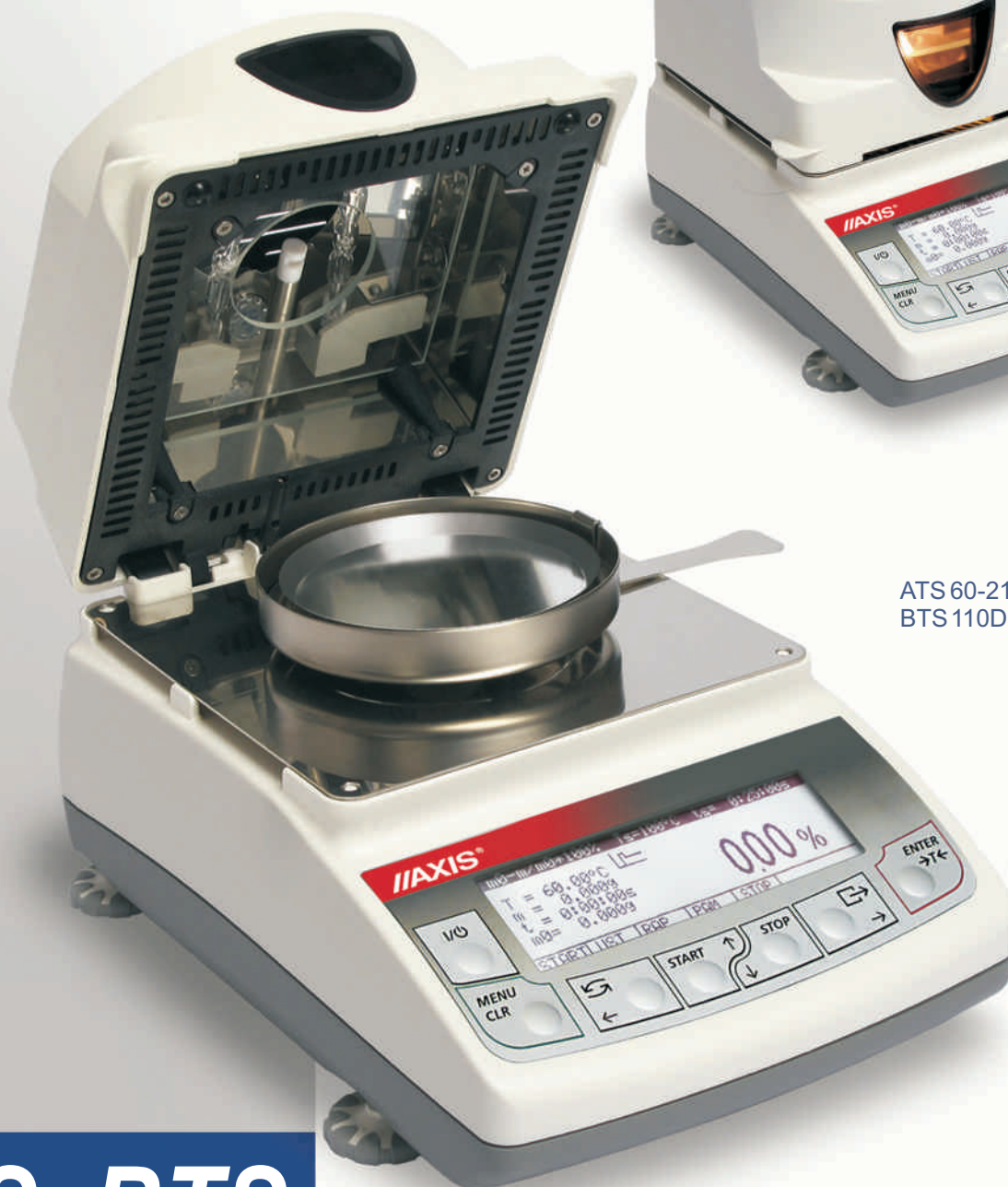
ATS 60-210 BTS 110D, BTS 110