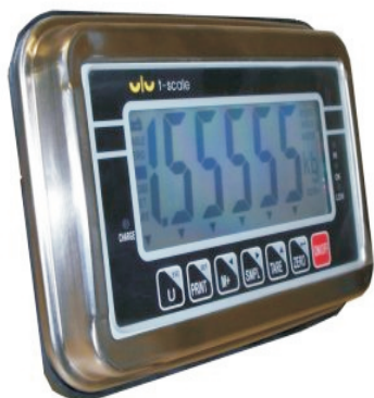
model shown BWS